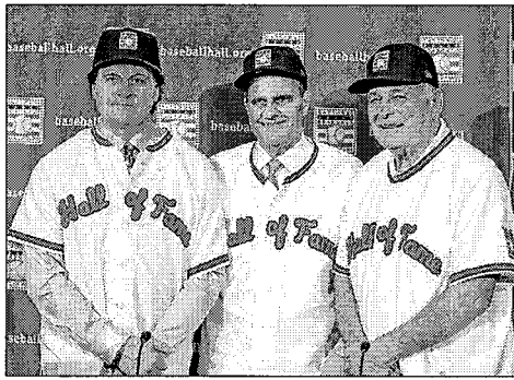
Retired managers, from left, Tony La Russa, Joe Torre and Bobby Cox gather for a photo after it was announced that they were unanimously elected to the Baseball Hall of Fame, at a news conference during MLB winter meetings in Lake Buena Vista, Fla., on Monday.

player — he was the 1971 NL MVP — and 2,000 wins in the dugout. "Joe taught a lot of us about how to win the right way and lose the right way," La Russa said. The savvy La Russa won World Series titles with Oakland in 1989 and with St. Louis in 2006 and '11, retiring days after beating the Texas Rangers in a seven-game thriller. Of the nine managers with three or more World Series titles, the other seven all have been inducted. La Russa finished with the third-most wins by a manager in a career that began with the Chicago White Sox in 1979 and ended with a record of 2,728-2,365. "I miss the winning and losing," La Russa said. "Someday I'll be with a team, I think. I'd like to be part of the competition again."